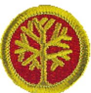
* Genealogy AM & PM