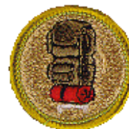
Backpacking ALL DAY