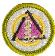
* Need Off-site Slip Dentistry ALL DAY Limit 8