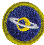
Astronomy ALL DAY