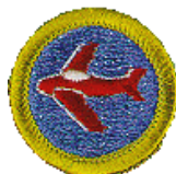
Aviation ALL DAY