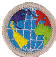
Have & read MB book; Cit. in the World ALL DAY Do #3,#7 before