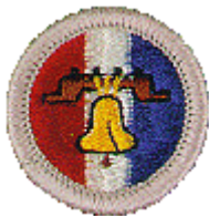
Cit. in the Nation ALL DAY