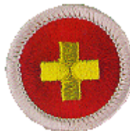
* Bring #2b First Aid ALL DAY