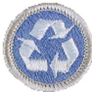
Environmental Science ALL DAY