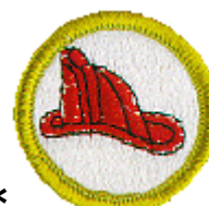
* Need Off-site Slip Fire Safety ALL DAY