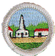
Do 2,3,7 and bring with Cit. Community ALL DAY