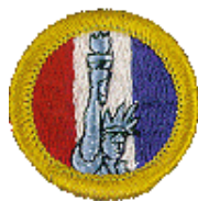
American Heritage PM Only