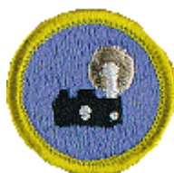
Photography AM ONLY Bring Camera

ASAP – Order your MB book through the Council office to ensure you have read it in time for the Clinic!