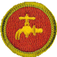
* Plumbing ALL DAY $5 fee

Prereq: 2 nd class 8a&b; 1 st class 9a-c; Have and read MB book; if wanted, may bring own face masks/fins/snorkels. Don't forget your trunks! © $1 Fee