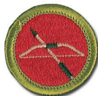
Archery ALL DAY