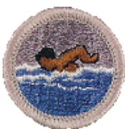
Swimming ALL DAY Limit 8 Need Off-site Slip

Prereq: 2 nd class 8a&b; 1 st class 9a-c; Have and read MB book; if wanted, may bring own face masks/fins/snorkels. Don't forget your trunks! © $1 Fee