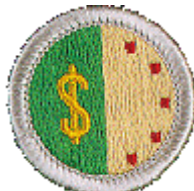
Personal Management All Day First Class or higher

NOT A MERIT BADGE Do not register for this!!! There will be a trapping demonstration in the PM. This will not replace any MB!!! Youth and adults will have the opportunity to sign up for a Certified Trappers Safety Course (similar to Hunters Safety) to be held at a later time and location.