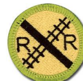
* Railroading ALL DAY