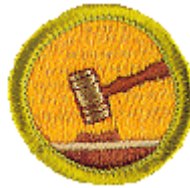
Public Speaking ALL DAY